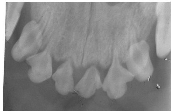
Radiograph of this same patient showing severe hypoplasia of the roots of the maxillary incisors. All teeth were affected to some degree and most required extraction.