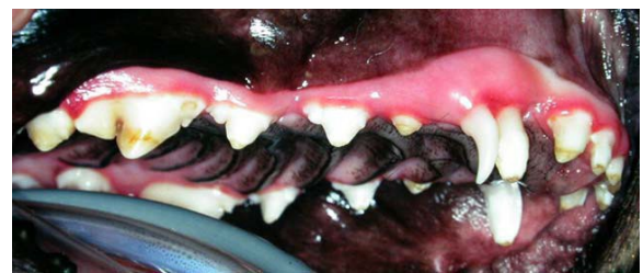
The right maxilla of a dog with generalized enamel hypoplasia and a persistent primary maxillary canine tooth.

Anything that disrupts the delicate ameloblasts during enamel production will result in defective enamel which may be very porous and weak. This defective enamel is often present at eruption