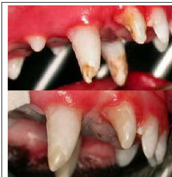
The localized enamel hypoplasia in this young dog was caused by inappropriate primary tooth extraction. The second photograph is of the right upper third incisor and canine teeth following removal of more defective enamel and restoration with a bonded composite resin.

A tooth that erupts with defective enamel that soon falls away has exposed dentin, which is sensitive and porous and so a potential pathway for bacteria to gain access to the pulp to cause a septic pulp necrosis. These freshly erupted teeth are immature, with thin dentin walls and wider dentin tubules than a mature tooth, and so they are at their most vulnerable at this phase. Therefore, early intervention (as soon as the