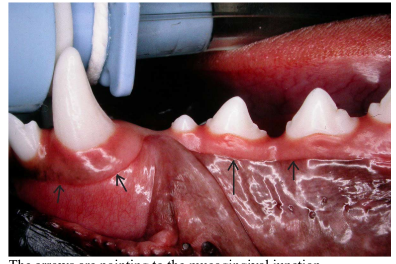
The arrows are pointing to the mucogingival junction.

at the junction with the lingual alveolar mucosa. The palatal surface of the maxillary attached gingiva blends with the equally firm and immobile palatal mucosa.