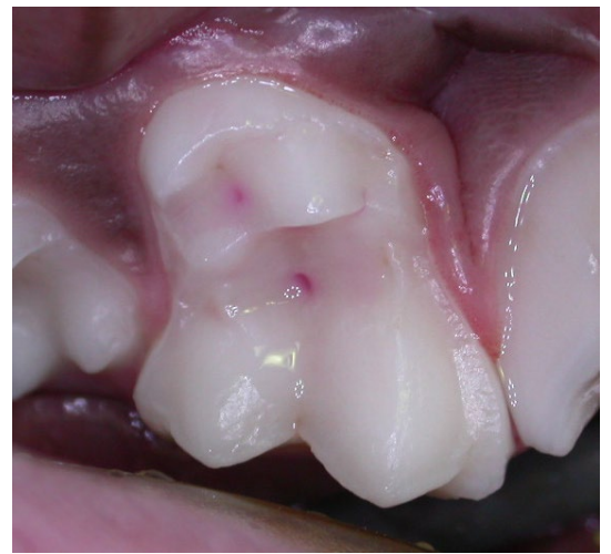
Some deep pits in a young dog's molar highlighted with a pink liquid. These pits had not yet developed any decay and were excellent candidates for prophylactic restorative work (Pit & Fissure Sealant).