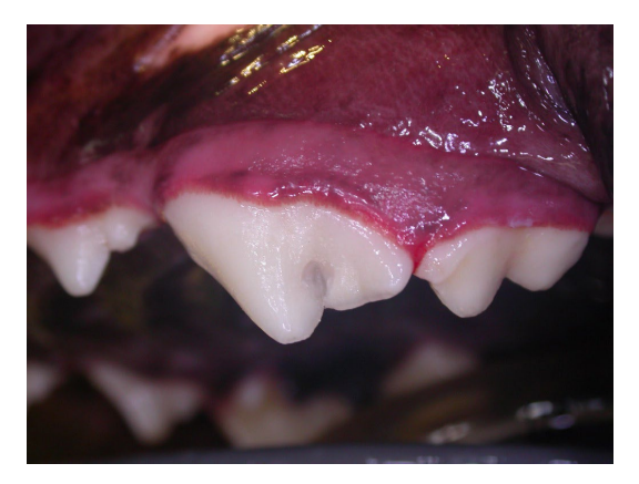
The developmental groove of the maxillary fourth premolar is also a site at risk. This one has been prepared for restoration by removing all the softened dentin and unsupported enamel