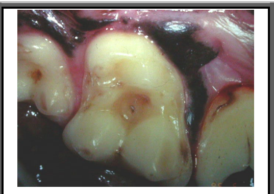
The tiny dark spot in the centre of the occlusal table of this maxillary first molar is a pit in the enamel with a caries lesion developing. This one can be restored.

Other locations at risk are the deep developmental grooves on the buccal surface of the maxillary fourth premolars and on the lingual side of the mandibular first molars between the mesial and central cusps. These grooves are often filled with calculus, but on deeper exploration, there may be soft, carious dentin at the base.