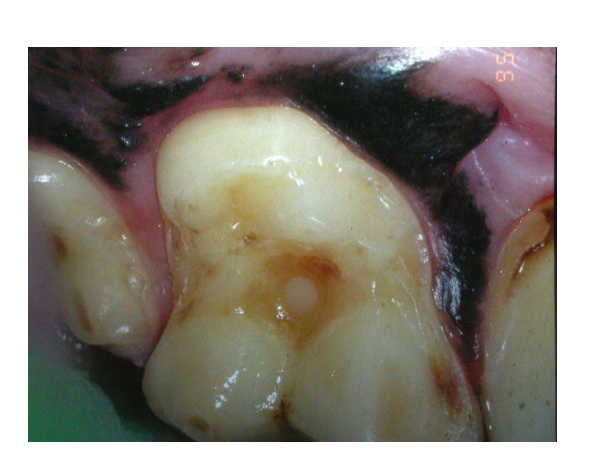
The molar from page 2 with its composite restoration in place.